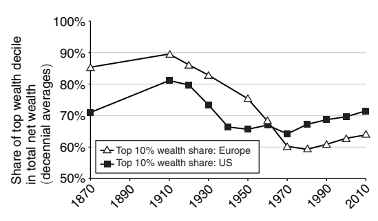
Figure 2. Wealth Inequality: Europe and the United States, 1870–2010

Let me first say very clearly that r > g is certainly not a problem in itself. Indeed, the inequality r > g holds true in the steady-state equilibrium of the most common economic models, including representative-agent models where each individual owns an equal share of the capital stock. For instance, in the standard